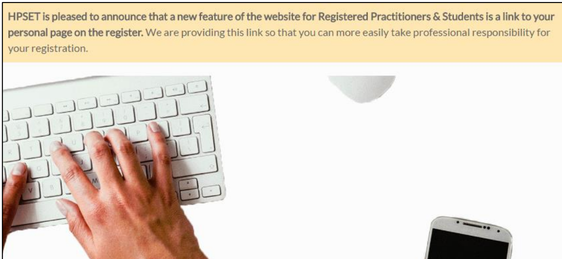
Figure 2: Registered Practitioners and Students area on the website

The challenge is now to keep the website up to date, relevant and a reflection of the profession and the values we all hold and practice. Please let me know if you have specific requirements for new sections or specific information and we can work together to develop these areas.