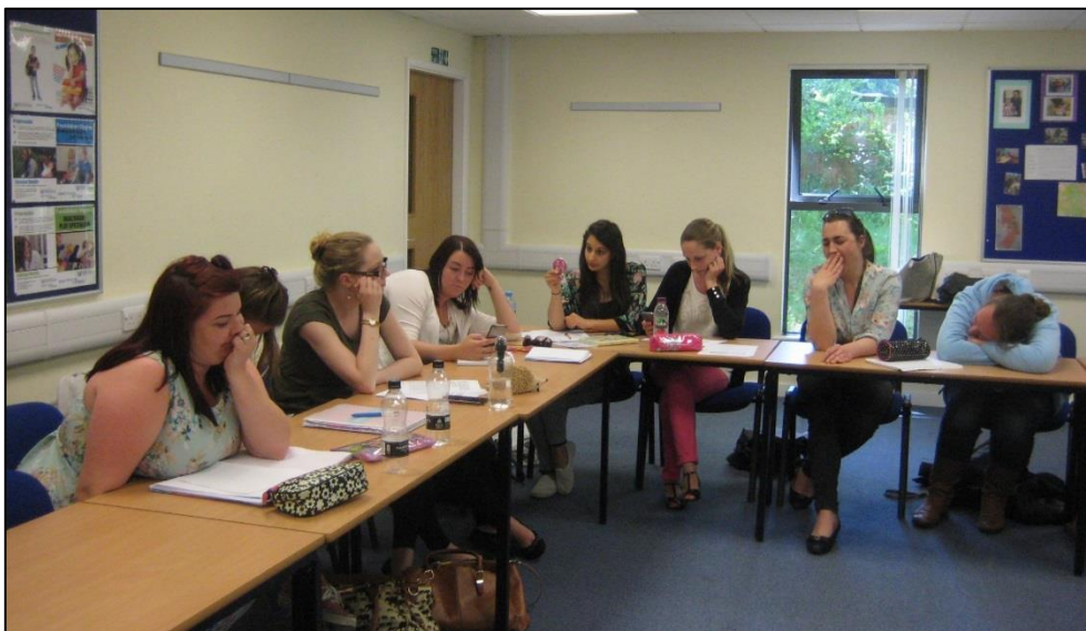
Figure 4: Student engagement – playful participation

This has been another good year for the FdA HPS course and we have really enjoyed teaching both sets of students who have actively shared in the teaching process. One of the benefits of delivering a course advocating a playful pedagogy is the implicit permission to use play based strategies for teaching and the students have energetically engaged with this approach – for example, posing on request for photographs used in conference presentations showing our lively teaching sessions.