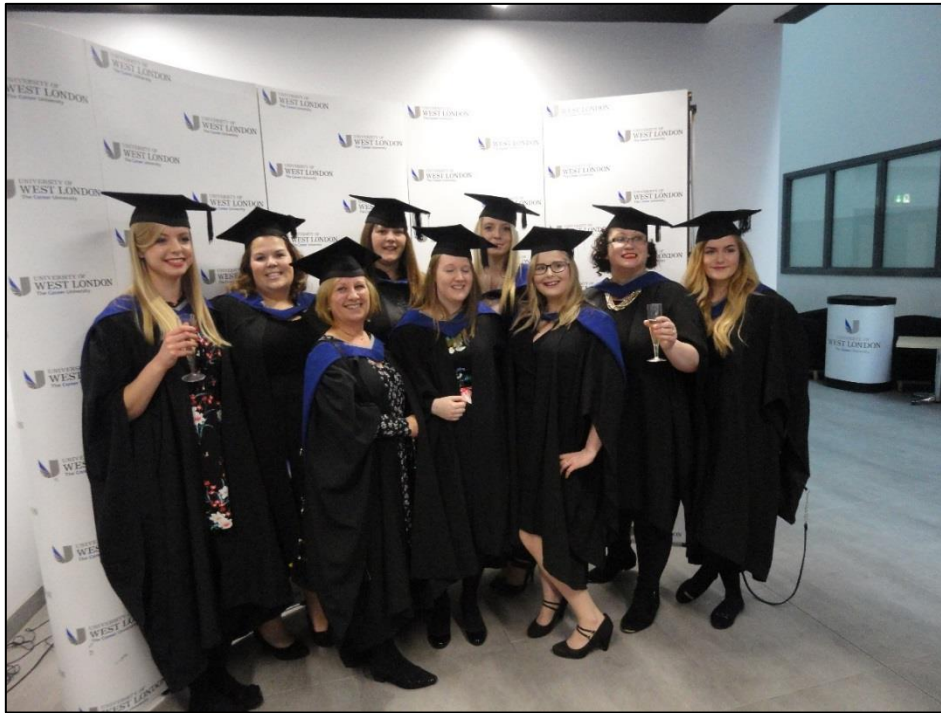
Figure 3: Our graduates at the UWL Graduation Ceremony

This has been a successful year at North Warwickshire and Hinckley College, which has seen the second cohort of students successfully completing the second year of the course and graduating. This has led to 2 students registering with HPSET as Registered Play Specialists. Most of these students have been successful at gaining employment.