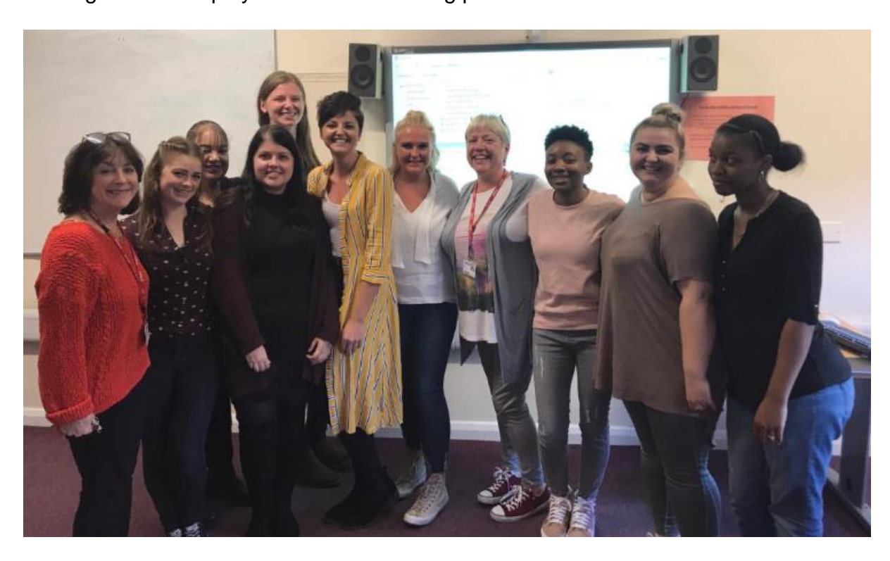
Figure 2: September 2017 students

The September 17-19 cohort began with 15 students; 2 students withdrew early on in the course and did not complete any module assignments. 13 students successfully achieved level 4, however 1 has deferred her place in year 2 as she required surgery which has impacted on her mobility. This group has made a successful transition with 3 being offered employment in their training placements.