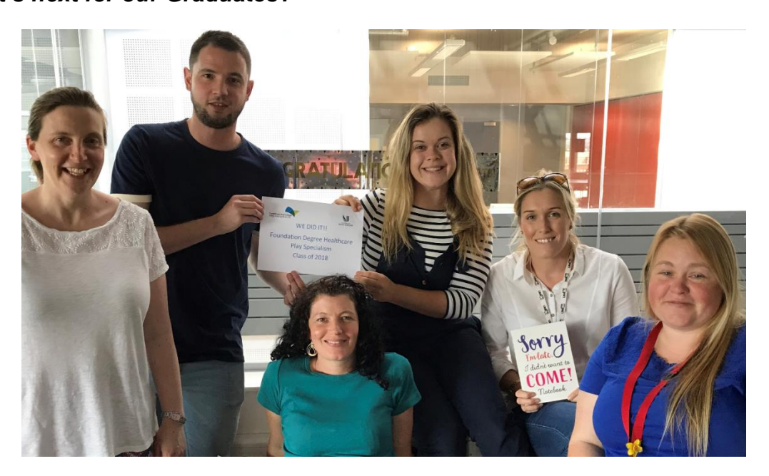
Figure 1: Class of September 2018

This September we welcomed the 2016-18 cohort to our graduation ceremony. In the New Year, one student, previously a primary school teacher, will become the new HPS joining the play team at Southampton Hospital. Here she will be dividing her time between the Young Person's unit and the emergency department. Now qualified, another will continue to support young people diagnosed with cancer at Bristol Children's Hospital. His role and training was funded in part by CLIC Sargent, a charity which supports young people diagnosed with cancer and their families.